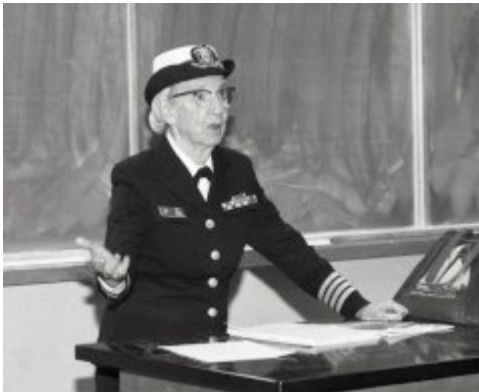
Navy Rear Admiral Grace Hopper